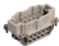
TE Part # T2040102101-000 HE-010-M