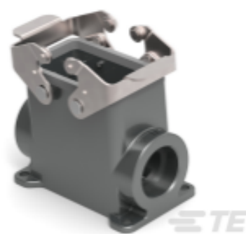
TE Part # T1470101129-000 H10B-SGRHS-PG29