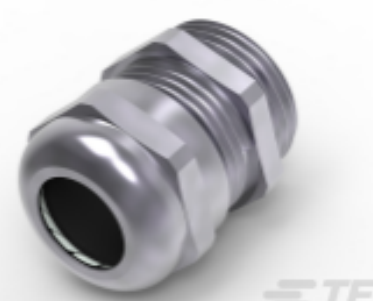
TE Part # T3609290101-000 DLX-29-MS