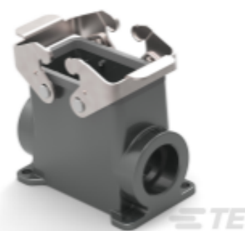
TE Part # T1470102229-000 H10B-SGRH-2PG29