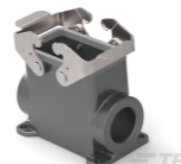
TE Part # T1470102129-000 H10B-SGRH-PG29