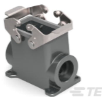
TE Part # T1470101229-000 H10B-SGRHS-2PG29