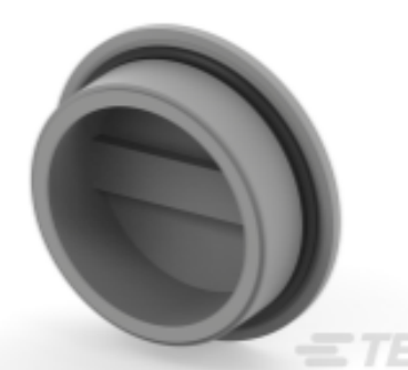
TE Part # T3166290101-000 BLIND-29-P